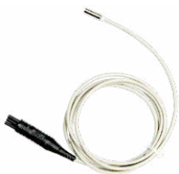
ST-1 temperature probe WASONT1