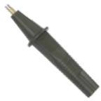
Double pin Kelvin probe (2 pcs.) WASONKEL20GB