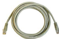
LAN cable (RJ45) WAPRZRJ45