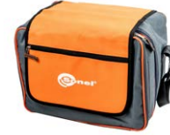
L-11 carrying case WAFUTL11