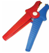
Kelvin crocodile (2 pcs) WAKROKEL06