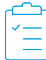
Calibration certificate with accreditation