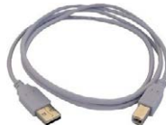
USB cable WAPRZUSB