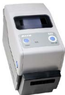
D2 portable USB report / barcode printer (Sato) WAADAD2