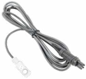
temperature probe ST-3 WASONT3