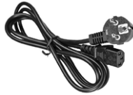
Mains cable - IEC C13 plug WAPRZ1X8BLIEC