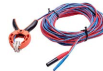
25 m double-wire test lead (Kelvin crocodile clip / banana plug) WAPRZ025DZBKEL