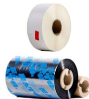
label roll – black on white for D2 printer (SATO) WANAKD2 ribbon for D2 printer (SATO) WANAKD2BAR