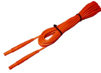
test lead 5 m, red, 1 kV (banana plugs)