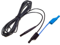
test lead 5 m, black, 1 kV (banana plugs, shielded)