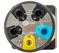
CS-1 cable simulator