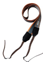
meter strap (type M-1)