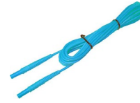
test lead 5 m, blue, 1 kV (banana plugs)