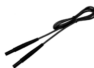
test lead with banana plugs; 1 kV; 1.2 m; black