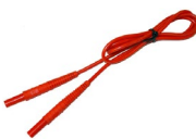
test lead with banana plugs; 1 kV; 1.2 m; red