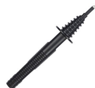
test probe with banana socket; 1 kV; black