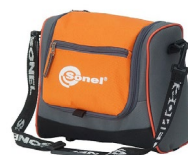
M-6 carrying case