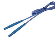
test lead with banana plugs; 1 kV; 1.2 m; blue