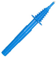
pin probe, blue 1 kV (banana socket)