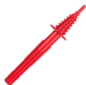
test probe with banana socket; 1 kV; red