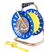
Test lead 75 / 100 / 200 m yellow, for MRU (banana plugs, on a reel)

WAPRX075BUBBSZ WAPRX100BUBBSZ WAPRX200BUBBSZ