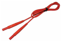
Test lead with banana plugs; 1 kV; 1.2 m; red