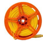
Earthing measurement test lead with banana plugs on reel; 50 m; yellow