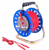
Test lead 75 / 100 / 200 m red, for MRU (banana plugs, on a reel)

WAPRX075REBBSZ WAPRX100REBBSZ WAPRX200REBBSZ