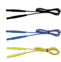
Test lead 1.2 m CAT III/1000V CAT IV/600V black/blue/yellow