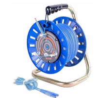
Test lead 75 / 100 / 200 m blue, for MRU (banana plugs, on a reel)

WAPRX075REBBSZ WAPRX100REBBSZ WAPRX200REBBSZ