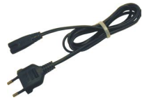
230 V power cord (IEC C7 plug)