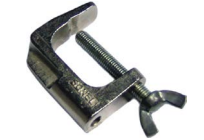
Clamp terminal with banana plug termination