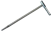
2x earth contact pin probe (30 cm)