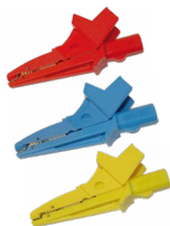
Crocodile clip, 1 kV 20 A red/blue/yellow