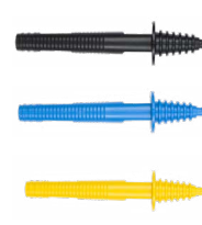
Pin probe CAT III/1000V CAT IV/600V black/blue/yellow