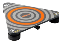
PRS-1 resist- ance test probe