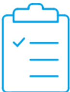
Calibration certifi- cate issued by an accredited laboratory