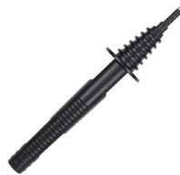
Pin probe 11 kV (ba- nana socket) black