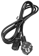
Mains power cable Uni-Schuko / IEC C13 plug