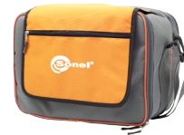
L4 carrying case