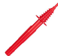
Pin probe 11 kV (banana socket) red