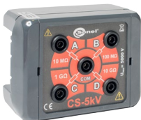
CS-5kV cali- bration box

WAPRZ003REBB10K WAPRZ005REBB10K WAPRZ010REBB10K WAPRZ020REBB10K